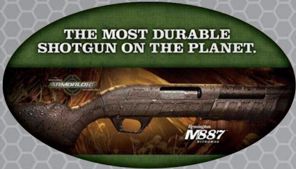
Floor Mat #1