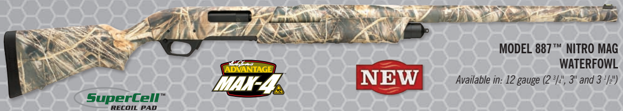
MODEL 887™ NITRO MAG WATERFOWL Available in: 12 gauge (2¾", 3" and 3½")