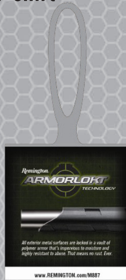
ArmorLokt™ Trigger Tag