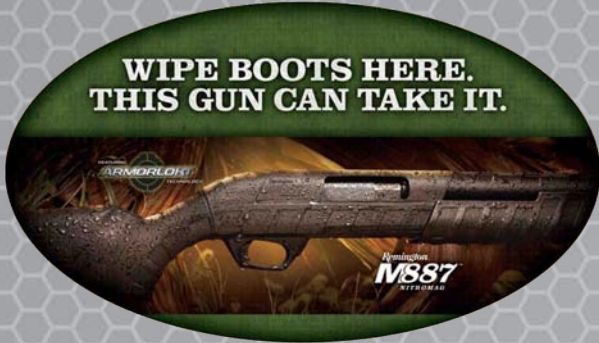
Floor Mat #2