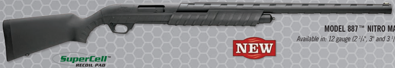
MODEL 887™ NITRO MAG Available in: 12 gauge (2¾", 3" and 3½")