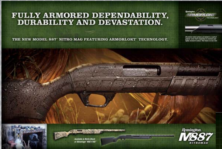
Banners & Window Decals